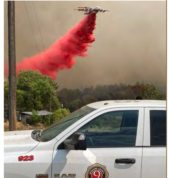
FIRE 9 PERSONNEL SUPPORTING AIR OPERATIONS.

Interagency agreements with the Washington State Fire Marshal's Office, Washington Department of Natural Resources, and the Bureau of Land Management have been in place for many years with Spokane County Fire District 9. The reason for these agreements is to provide a process to mobilize District firefighters and equipment to respond to emergencies outside the Fire District. In addition, the agreements allow the Fire District to